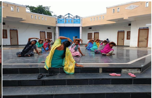
APO visit and pregnant women daily practicing Yoga