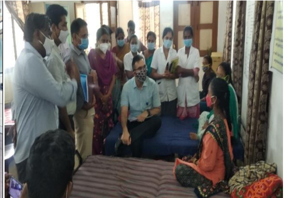
Project Officer, ITDA, Parvatipuram Visit YTC and interacted with Pregnant women and also NITI-AAYOG team has visited the YTC along with Project Officer, ITDA, Parvatipuram.