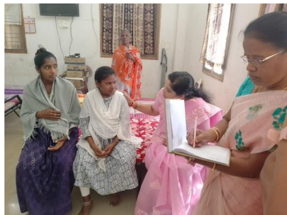
Smt.Sandhya Rani, Honourable Minister for Women & Child welfare and Tribal Welfare visits YTC, Salur