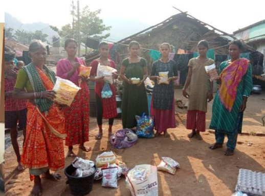
Joint director, Dept of Women & Child Welfare, Vijayawada visits crèche centers of NEED.