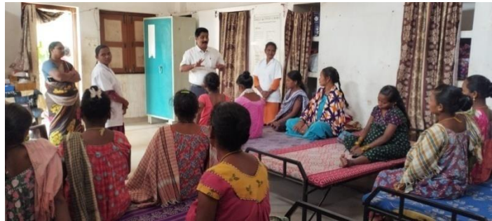
Pregnant women Health Checkups and NEED Director creates awareness on Health & Hygiene