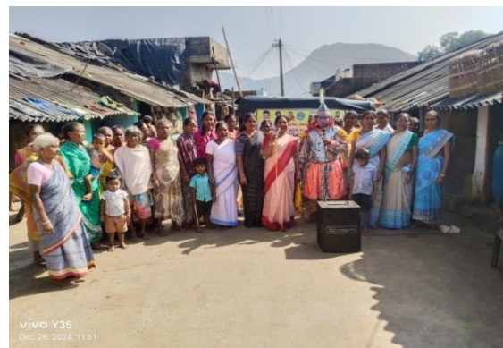
Field Level Kalajata programmes on Health and Sanitation and participated community members.